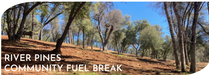
RIVER PINES COMMUNITY FUEL BREAK